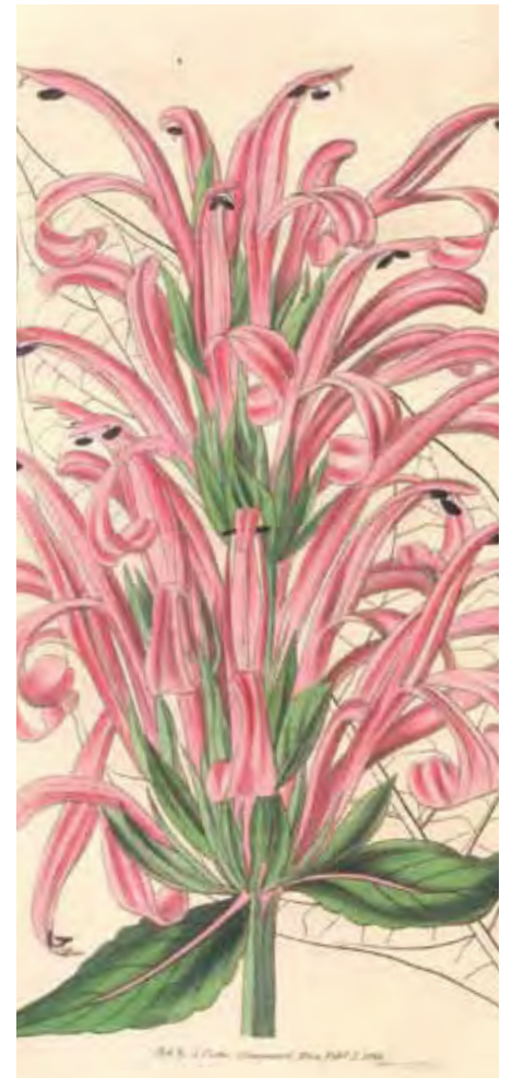
Flesh-coloured Justice – Curtis's Botanical Magazine 1787